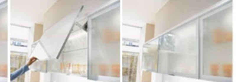
Thanks to the integrated BLUMOTION, both heavy and light fronts close silently and effortlessly