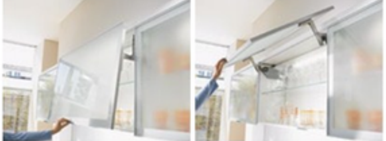
AVENTOS HS provides ease of use that inspires. Even heavy fronts are easy to open thanks to the light operating forces. The variable stop ensures that the front always remains in the desired position