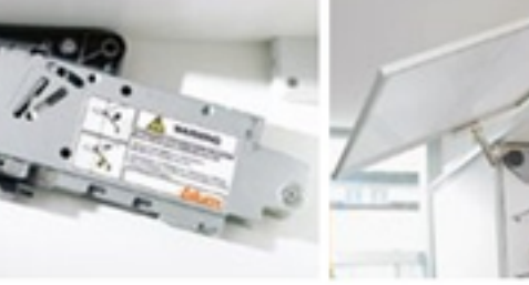
No protruding parts kitchen installation

Excellent durability nism is a robust spring package. The result: excellent durability