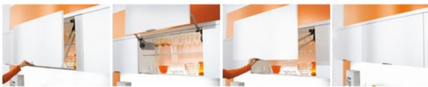
Regardless of the weight and size, AVENTOS HL only requires light operating forces for easy opening and closing. The variable stop ensures silently and effortlessly that the front always remains in the desired position